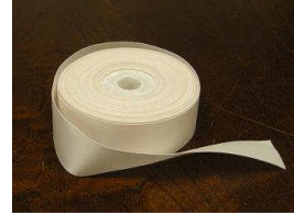
DEODOREY - Woven tape "DeodoranTape"