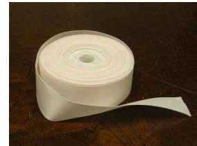
DEODOREY - Woven tape "Pearl"

<Specifications> - Custom-made Tape width: 5mm - 1,200mm Length per piece: 3m - 100m Warp: Polyester Woof: "WeftYarn" Weave type: Twilled, Grosgrain and Satin. Contained deodorant thread: 11m/10cm-tape (Tape: W30mm, Satin, 1ply-Type-NS) Color: Pinkish white Usage: a inside lining of a cap/wig, etc.