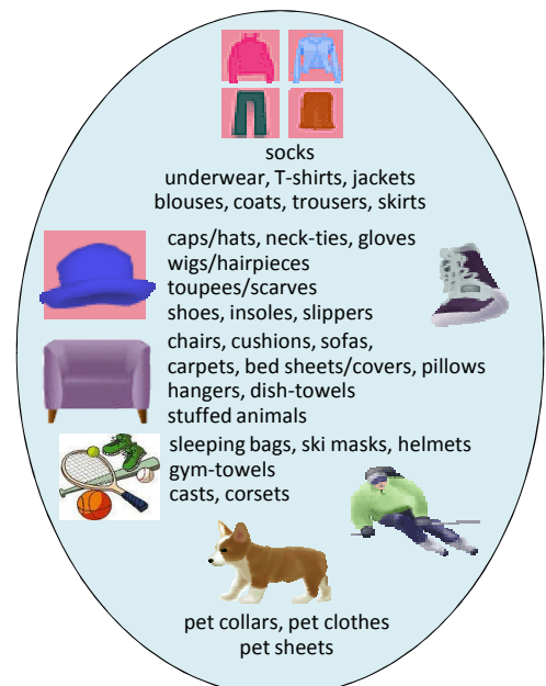
[Fig-3] "DeodorantThread" Applications